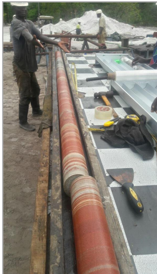
FIGURE 1: DRILL CORE FROM BA002 SHOWING EXTENSIVE POTASH (CARNALITE) MINERALISATION

Geological logging in BA002 has confirmed the presence of multiple potash beds in close proximity to the top of the salt sequence. At Kore Potash's Sintoukola Deposit just 85kms to the south, these multiple beds are host to high grade sylvinitic mineralisation (Figure 3).